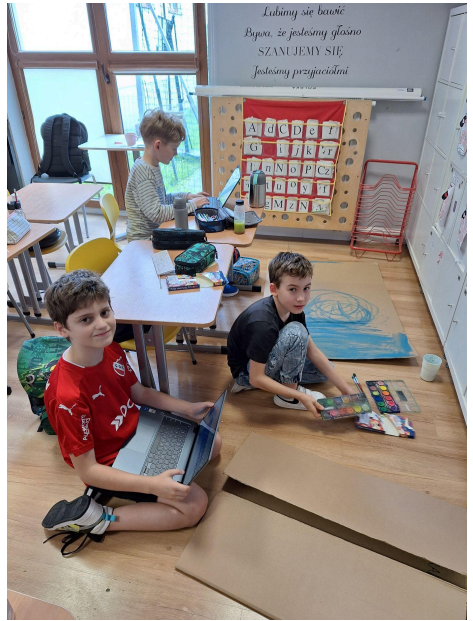
Working on our Science Fair projects!